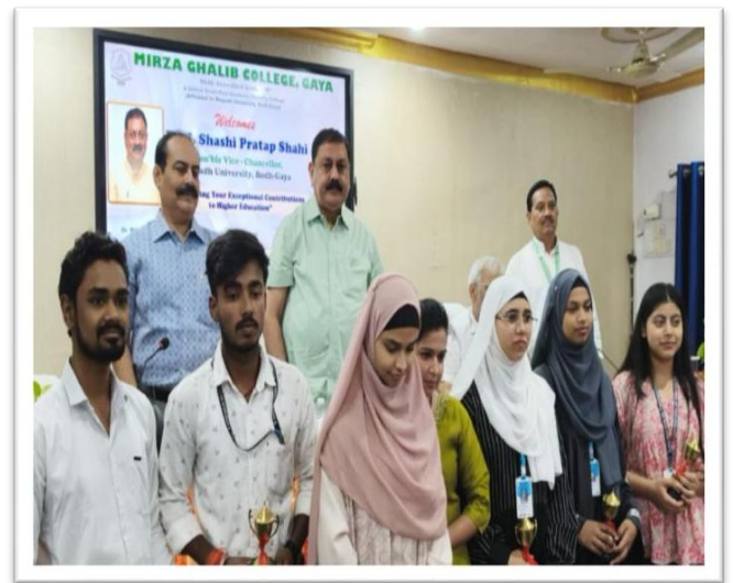
Felicitation of the Students by the Hon'ble Vice-Chancellor for their Outstanding Contribution to the college