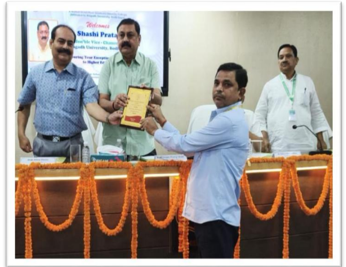
Felicitation of the Non-Teaching Staff by the Hon'ble Vice-Chancellor for their Outstanding Contribution to the college